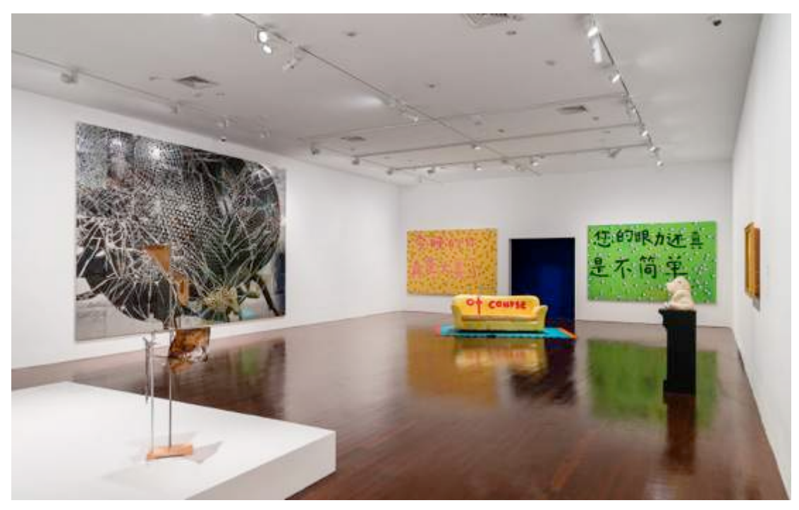
OVERPOP at Yuz Museum Shanghai, Exhibition Design by Studio Gardère