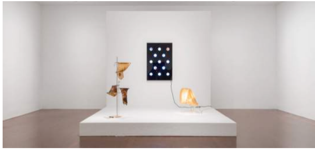
OVERPOP at Yuz Museum Shanghai, image courtesy of Yuz Museum Shanghai, Exhibition Design by Studio Gardère, Photo by Alessandro Wang