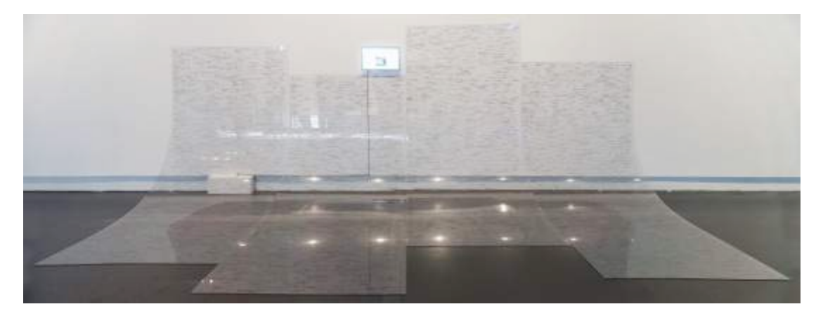
OVERPOP at Yuz Museum Shanghai, image courtesy of Yuz Museum Shanghai, Exhibition Design by Studio Gardère, Photo by Alessandro Wang