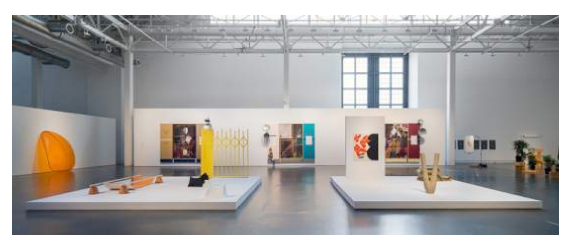
OVERPOP at Yuz Museum Shanghai, image courtesy of Yuz Museum Shanghai, Exhibition Design by Studio Gardère, Photo by Alessandro Wang

but their work is more than "post-internet" art. It incorporates the historical tradition of Pop Art in addition to responding to the acceleration of digital imagery. The artists emphasize precision of craft and execution. The artist's hand is generally subsumed within an aesthetic of industrial and artisanal fabrication techniques.